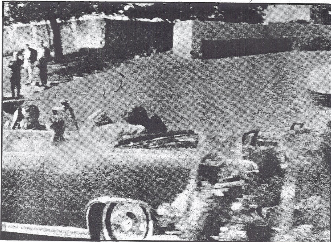
The assassination scene: new evidence brings up the possibility of a Mafia-CIA conspiracy

If they were not, their presence at that spot at the very same time has to be one of the most amazing coincidences of all time!