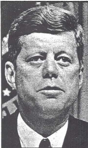
JOHN KENNEDY... is his killer still alive?

Before Castro gained control of the Cuban Government, the country had been a lucrative bonanza for the Mafia... So they had every reason to put Castro out of business... It must have been another blow to underworld bigwigs when JFK turned down all suggestions to assassinate Castro... It could have made him the number-one target on their own hit list!