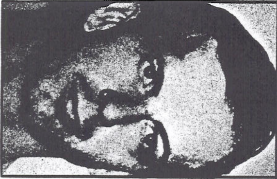
OSWALD... few believe he was the killer

It has been reasonably established that both CIA operators and Mafia henchmen were present during the murder of JFK... There is cause to believe that they knew each other — and were considered to be experts in the art of assassination... Were they involved in the events of that tragic day in history? If not, it has to be an amazing coincidence!