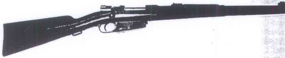
Fig. 2. The Argentine Model 1891 Carbine

must be said that it also has features which are most dissimilar to a Carcano. The FN - Fusil Carbine 7.65mm has a sleeved barrel, meaning that the barrel of the gun is, effectively a tube within a tube. This was designed so that if the wooden stock of the gun should warp due to damp conditions, the accuracy of the weapon would not be affected. The overall visual effect of this design feature is to give a noticeably fatter barrel. (5)