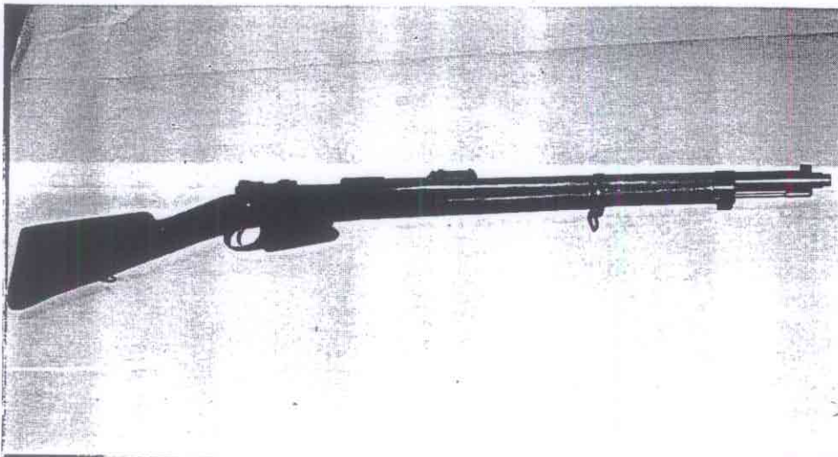
Fig 1. The Belgian Fabrique Nationale Fusil FN-Mauser Carbine 7.65

Its sister weapon, the carbine is simply a shorter version of the rifle and was originally intended for use by cavalry. This firearm is superficially similar to the Mannlicher-Carcano Model 1938 6.5 mm (Oswald's alleged weapon). Its length matches the Italian weapon to within an inch or so. The bolt arm bends downward, again similar to the Carcano and unlike most other Mausers (including the rifle mentioned above, which has a straight bolt arm), and most importantly, the Belgian Carbine has a box magazine below the stock, in front of the trigger guard which mimics the alleged murder weapon. It