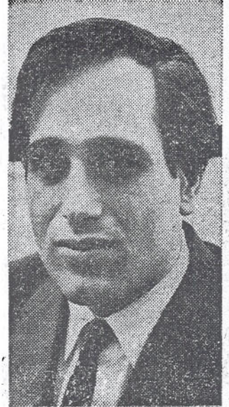
EDWARD JAY EPSTEIN

was to discover how the Warren Commission operated—how it organized its work, how it conceived of its function, what limits it set to its investigation, and how it selected from the mass of conflicting evidence those details on which it based its findings.