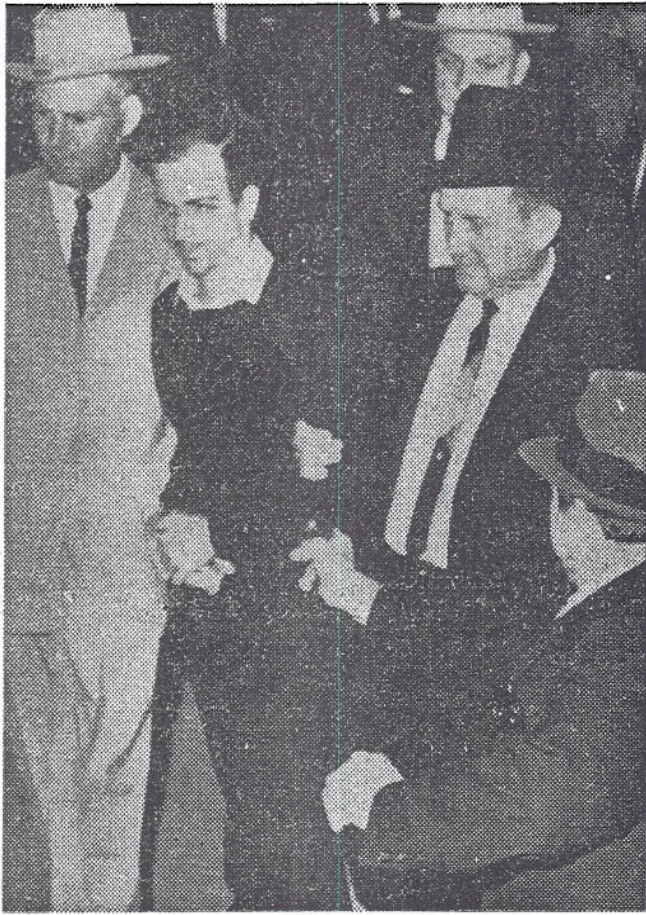
The shooting of Oswald.