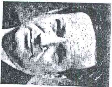
FRANK MANKIEWICZ 'Most plausible theory.'