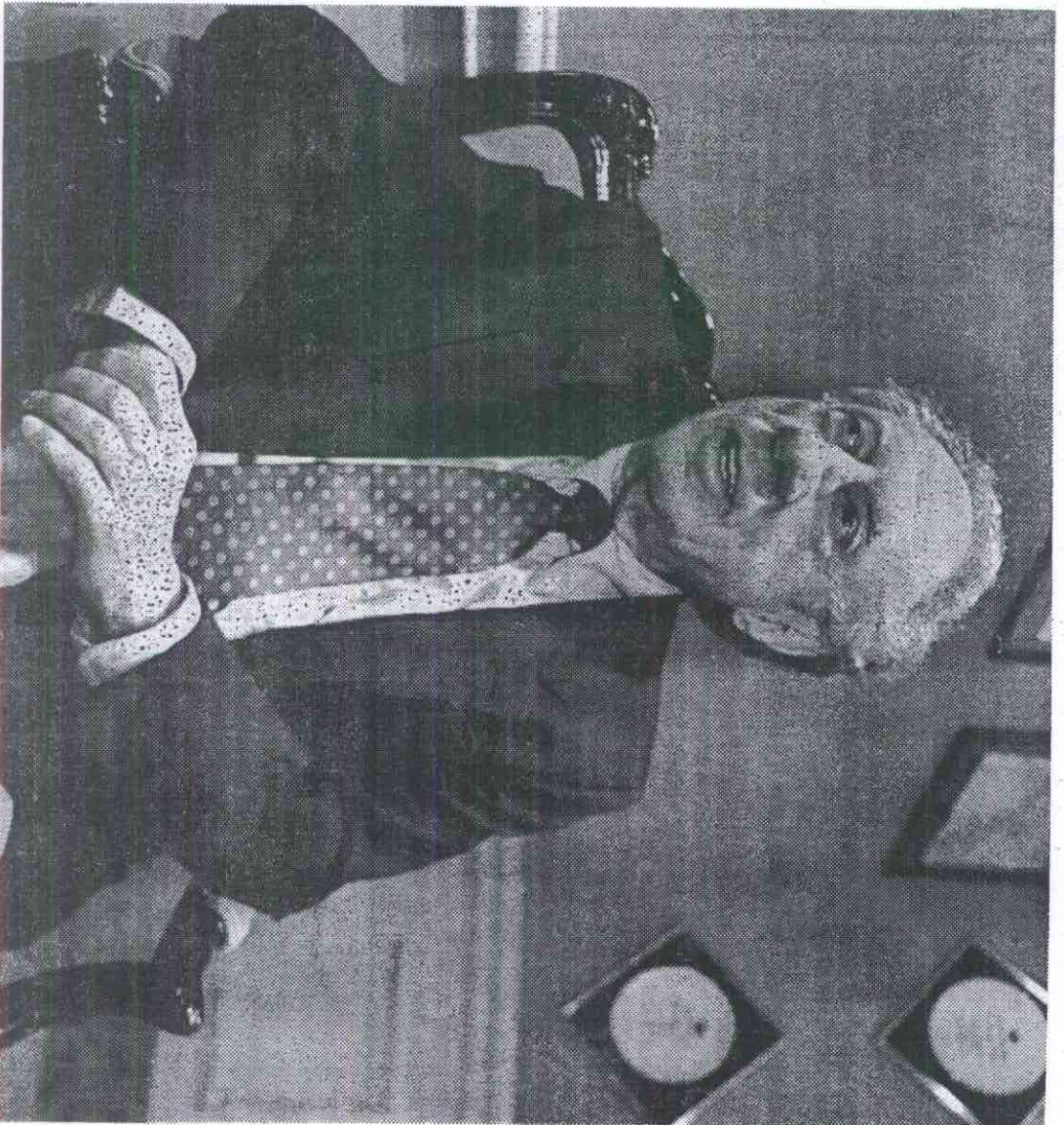
Frank Ragano says a dying Santo Trafficante confessed to the assassination of President Kennedy: "He was a slick man. And I think maybe he owed me something. It could very well be that he didn't think I'd say anything about it."