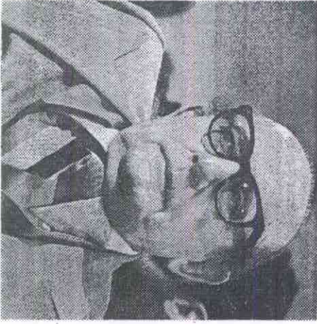
Trafficante before a hearing of the House Select Committee on Assassinations in 1977