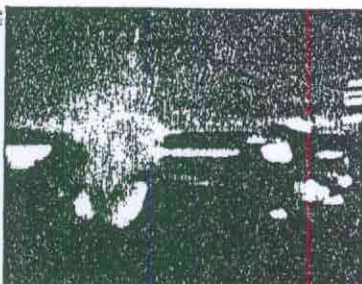
From Viking's The Killing of a President .