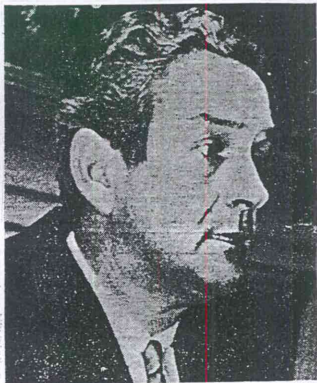
Senator John Connally, who was seriously wounded during the shooting of President Kennedy, but is now in a satisfactory condition.

Mrs. Connally said Mrs. Kennedy turned to her husband and made the remark as they rode past cheering crowds in Dallas.