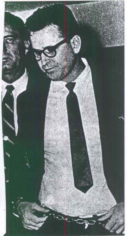
James Earl Ray

After the assassination of President Kennedy, assassin Lee Harvey Oswald also acted in a strange, irrational manner. "Oswald's movements can become understandable only if we consider that he was controlled," a critic of the Warren Report has stated. "It is entirely possible that Oswald was under some sort of mind control. He might have been hypnotized. You are undoubtedly (Continued on page 60)