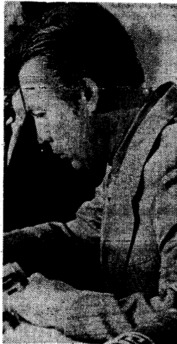
Rep. Robert W. Kastenmeier (D., Wis.), whose House Judiciary subcommittee began hearings last week on First Amendment issues.

But the meaning of the First Amendment is that Government's judgments—including judgments about what should be made public—can be contested by the exercise of a free press. So we get down