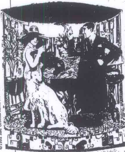
©1992 Red Grooms/AMS, New York