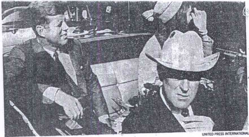
President and Mrs. John F. Kennedy with Texas Gov. John B. Connally on Nov. 22, 1963