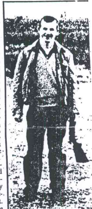
Lee Harvey Oswald

560 pages Publisher's price $25 92-5832 Club price $19.95 One Book-Dividend Credit given