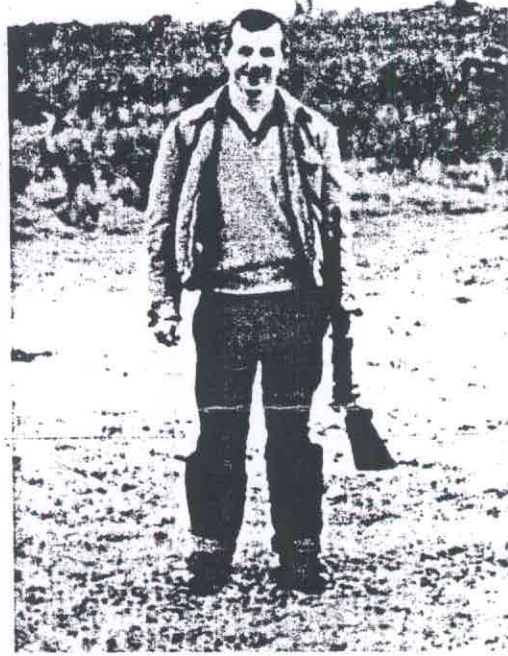
A rare photo of Lee hunting while on his first leave from the Marines in February 1958, when he visited his family in Fort Worth, Texas.