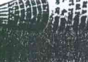
shut-the-cock (shut'ye- cock), n. 1, Also called shuttle, the object which is struck back and forth in the operation and barbed, consists of a feathered cork head and a shaft. 2, the cork head and barbed shaft. 3, to send or bang. 4, to move or be handed to and fro.—adj. 5, of such a state or condition. —shut-the-cock, det.

amateur photographer. 15, shut up, to shut to the house [shut'er fē], n. Brit. Informal, Shut-er, v. to shut down; to shut down poured concrete or rammed earth. [Imit.] -shut/ing shū't'ing, the stile of a door or a shutter against the frame of the opening. C. shutter. 16, Informal, shut up, to shut shutter. shut-up (shut'up), n., v., -shut, -ing. Once in a room for passing or shooting the through the shed from one side of the web to usually consisting of a board-shaped piece of material. 2, a person who is in a room for 2, the sliding machine. 3, a public conveyance, as a serving or bus, which travels back and forth arrivals on a particular route, esp. a short one connecting two transportation systems. telescope (def. 1).—shut, v. 1, to close (some- thing) or to move to and fro on a track and forth by or as if by back and forth shutting the sockets to and fro; consistently —c; 6, between city and suburb. [ME shut'le harpoon, akin to shun, shoot'] —shut/like, det.