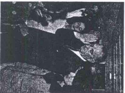
Martin Luther King