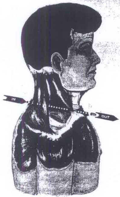
COMMISSION EXHIBIT 385

Mr. Lee Harvey Oswald speaks Russian language. In his three-year experience in my opinion, he is a Russian and perhaps a