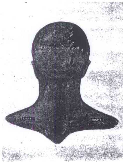
COMMISSION EXHIBIT 386