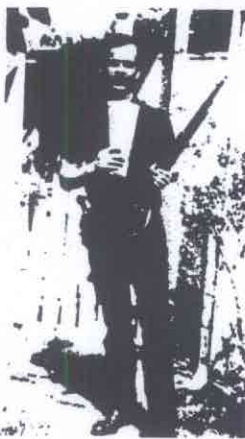
The lone assassin? Lee Harvey Oswald, with the rifle that investigators said was used to kill John F. Kennedy. Grief and fear: Marina—shown at Oswald's funeral—was afraid she and her children would be shot, too

house in Dallas near where he worked, and she in a suburban home. Suddenly, Marina recalls her landlady told her that the president had been shot. "I was crying and praying that God would spare his life," she remembers, "because he is a father." She also remembers worrying, when she heard that the shooting had occurred outside the building where Oswald worked, that her husband, who had made threats against politicians in the past, was somehow involved.