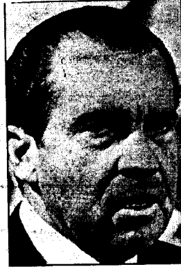
NIXON LOST to JFK because of Kennedy's "psychic abilities"

"I am sure if there had been a breath of fraud, Nixon would have demanded recounts — which he did not."