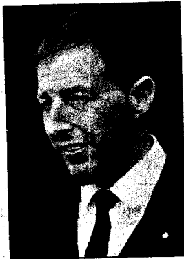
FARLEY MCGIVERN'S church has attributed 107 miracles to JFK

His ability to enlist thousands of volunteers to his side in 1952 when he was running against Senator Cabot Lodge for his seat in the senate, shows he had