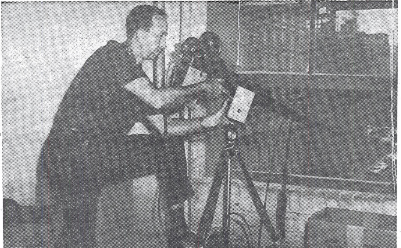
An investigator shows commission members the firing angle used by Oswald.