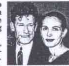
Lyle and Julia

again." Lovett says he and Julia have remained good friends — and