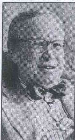
The New York Times