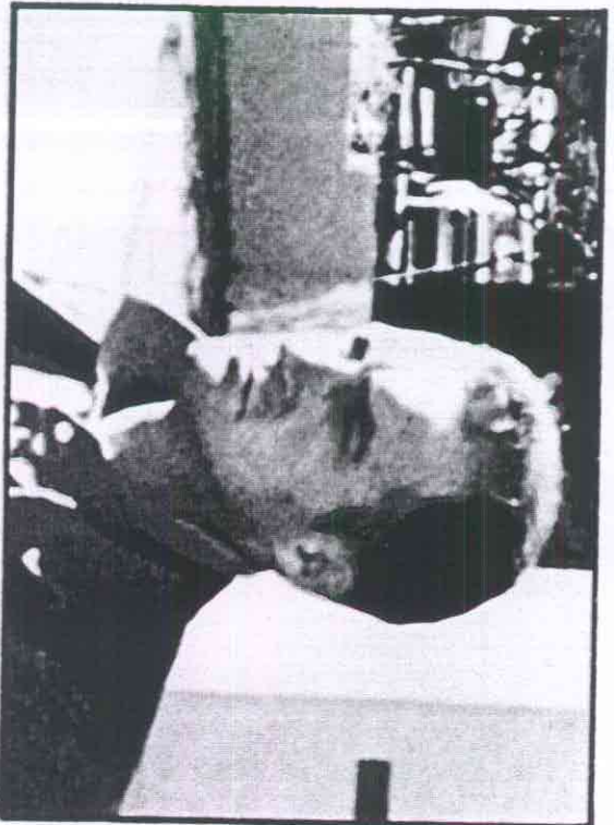
"Frenchie," one of several aliases.