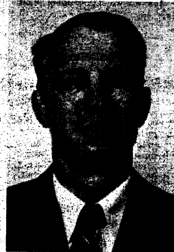
Dr. Frank R. Olson in 1952