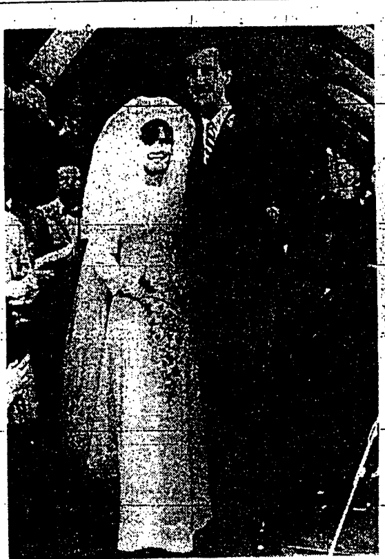
MARRIED—Sharon Percy, now Mrs. John D. Rockefeller, walks with her husband from Rockefeller Chapel following their wedding in Chicago.