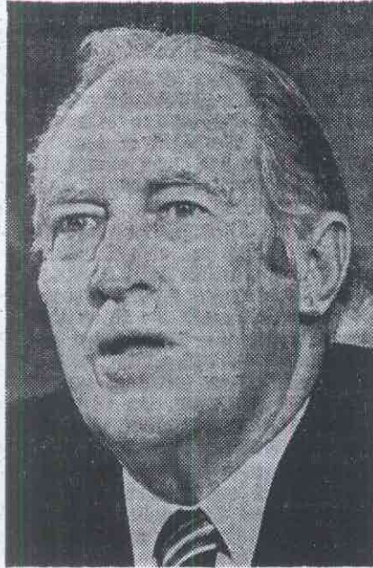
WILLIAM P. ROGERS ... "difficult period"

cian but a single-minded person preoccupied with foreign affairs, and he thought that was the best politics. In 1960, he made every decision down to what parade route to take, but in 1968 that bored him."