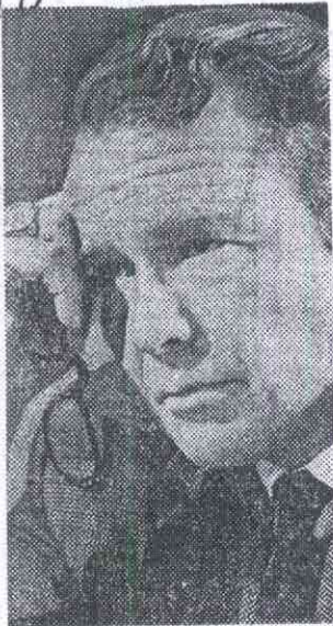
ROBERT H. FINCH ... said to decline offer

While the White House had no direct comment on the proposal, press secretary Ronald L. Ziegler said that Mr. Nixon was pursuing his own inquiry and was determined to find out "what happened, how it happened and why it happened."