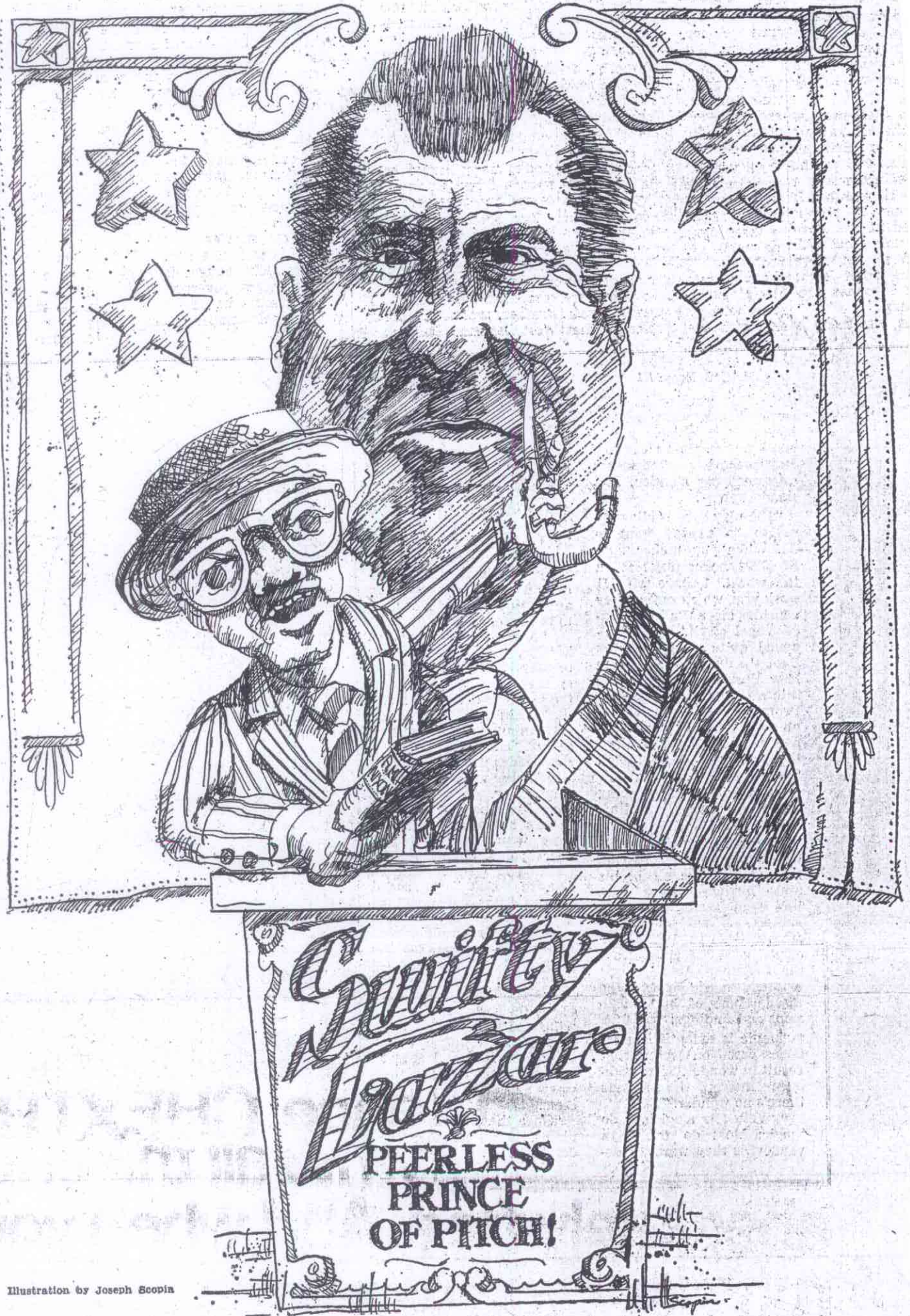
Illustration by Joseph Scopia