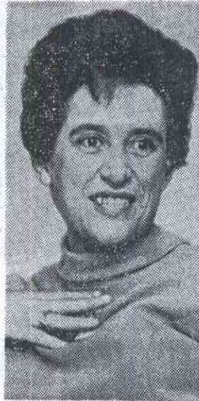
MRS. KLEINDIENST She wouldn't talk

Julie Eisenhower's smiling face was said to have instantly turned sober. Earlier in the week, when asked about the scandal during a news conference in Minnesota, Mrs. Eisenhower said: