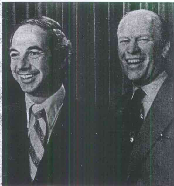
FORD INTRODUCING NESSEN Flawless start.

his tapes and presidential papers. As for the pardon, however, "there was no understanding, no deal, between me and the former President." Ford admitted that "the decision has created more antagonism than I anticipated."