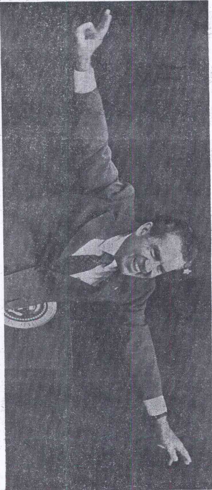
President Nixon flashes V for victory sign as he gets standing ovation from audience of ex-POWS assembled at State Department.