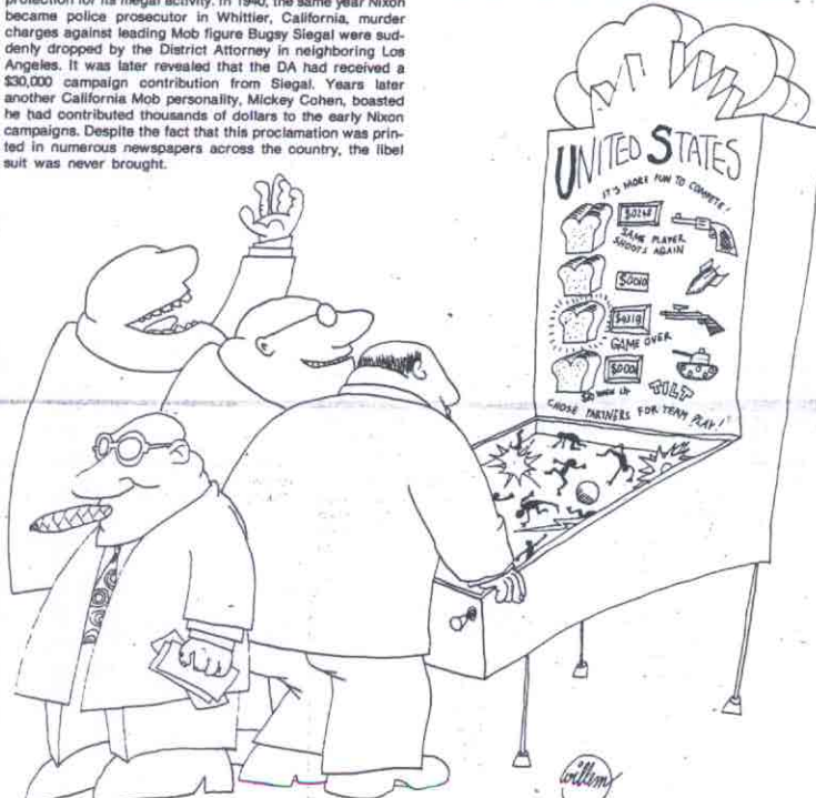
Las Vegas and liquor — Hoover's Friends

Southern Florida has virtually become the headquarters of Organized Crime and of the National Crime Syndicate network that dominates its international operations. Meyer Lansky, one of the first to get into the Florida market, set up