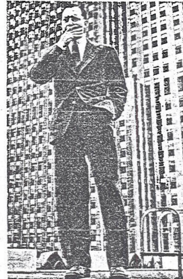
C.D. Jackson of Time Inc.: the CIA's head turned Bilderberg over to him.

Bedell Smith and the CIA is described in greater detail in the prince's biography, which states that the Bilderberg idea at first received a cool response from such as Averell Harriman, who thought it was too controversial. Said Harriman: "I won't touch it. It's dynamite." Bernhard, according to his biographer, ". . . saw a number of American politicians. After several more rebuffs he went to his friend Bedell Smith, who was then head of the CIA. Smith said, 'Why the hell didn't you come to me in the first place?'" General Smith then "turned the matter over to C. D. Jackson, and things really got going." It is interesting that the head of the CIA simply "turned