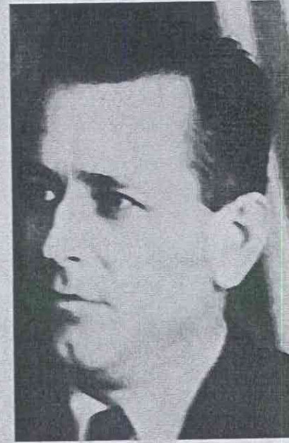
Aliases: Fugitive Ray (bottom right) used the names of four Toronto residents. Three were very similar to him in age, height, weight and coloring

ly correlate with Ray's story to Huie—except that all of his (pre-assassination) references to his "brother" became (post-assassination) references to Raoul. Ray told Huie that he returned from vacation to meet Raoul in Montreal, not his brother. In Ray's narrative, the only ventures he envisioned were criminal activities with Raoul, not "business" activities with his brother.