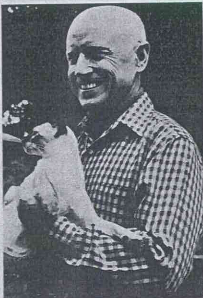
Bufs: Fiery Percy Foreman (left) was the second of numerous Ray attorneys; William Bradford Huie told the world Ray's 20,000-word story