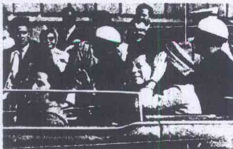
JFK RIDING IN MOTORCADE in Dallas next to wife Jackie and behind Governor and Mrs. John Connally of Texas. Only seconds later, the President was shot.