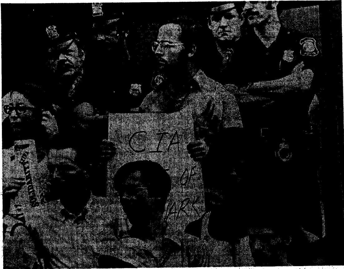
NCLC members demonstrating in Newark last summer.

New York City, is now running for governor of New York.