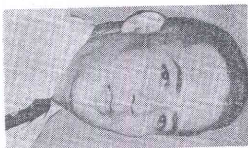
ED PLANER —States-Item Photo.