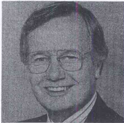
Bill Moyers, who's returning to network news as a commentator for NBC.

For PBS, Moyers's Public Affairs Television,