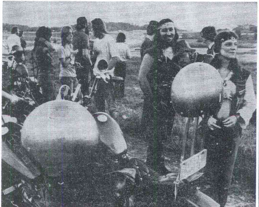
Members of various local clubs clown around while awaiting the arrival of other bikers.

That about uses up the notes, except that in Clancy's Bar on Good Hope Road SE, where everybody gathered before the wedding, and where there were six different topless go-go dancers.