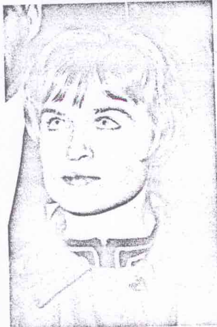
Upper left: Jack Ruby as he is about to shoot Lee Harvey Oswald. Left: Marina Oswald Above: President John F. Kennedy lays slumped down in the back seat of the car after being shot. His wife leans over him and a secret service agent stands on the bumper.