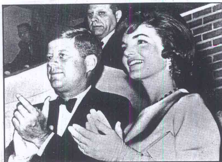
REPORT CLAIMS Jackie flew into a rage when she found out about JFK's affair