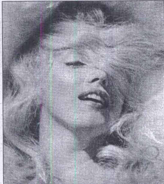
VOLEVA GRIDARE LA SUA FELICITÀ Hollywood (Los Angeles). Una delle ultime immagini di Marilyn Monroe. L'ultima, quando la vide il suo amante. La bambina che Marilyn ebbe da Kennedy, il 12 novembre 1963, quando era ancora in vita. Il fatto è che il giornalista francese ha visto la bambina che Marilyn ebbe da Kennedy, il 12 novembre 1963, quando era ancora in vita.