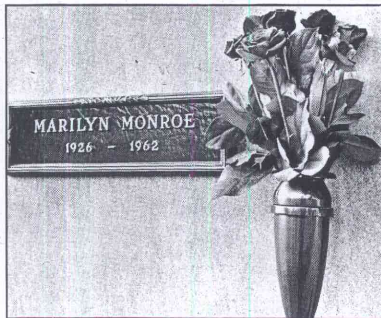
FLOWERS AND A NAMEPLATE on the wall of her tomb are all that remain of Marilyn Monroe's fame