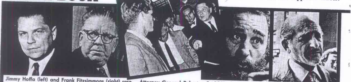
Jimmy Hoffa (left) and Frank Fitzsimmons (right) rose through union ranks together, starting in Detroit in the Thirties. Years later, Fitzsimmons succeeded Hoffa as Teamster president. Their power struggle began a month after Hoffa went to jail in 1967, when Fitzsimmons began to undercut Hoffa's authority and support.