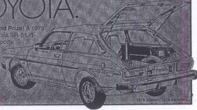
1978 Shown, 1979 Awarded

Super Grand Prize! A 1979 Toyota Corolla SR-5 Liftback—the sporty, thrifty, versatile top-of-the-line Corolla. The SR-5 Liftback's a winner—so go for it!