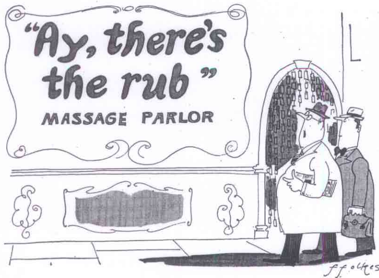
"Well, at least they seem to be literate."