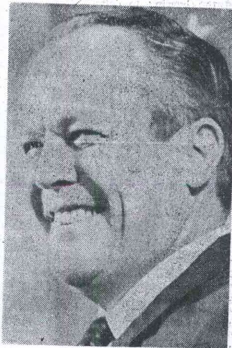
RICHARD G. KLEINDIENST ... a swirl of controversy