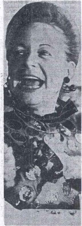
MARTHA MITCHELL ... "I didn't know"