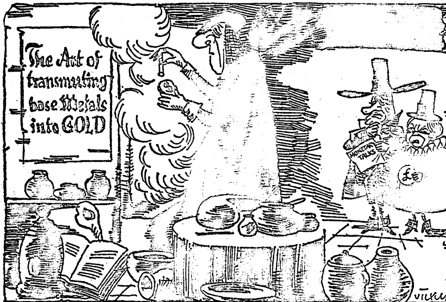
"Charles De Goldfinger at Work"

A socialist police state government will be the ultimate and inevitable result. There is no use protesting or hoping that the American people will protest. We're many years too late for that.