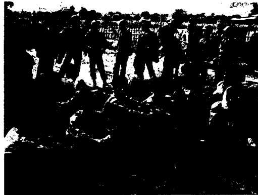
'LAOS. Lao soldiers guard North Vietnamese Regular Army soldiers after their capture in Thakhek, Khammouane Province. The Vietnamese soldiers were guarding a cave containing Communist Chinese-manufactured weapons and supplies.

Soviet foreign policy has been complicated by the ideological divisions which