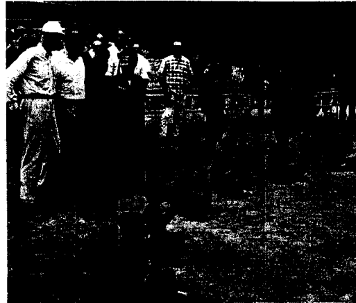
VIET-NAM REVOLUTIONARY DEVELOPMENT. Vice President Humphrey and Ambassador Ellsworth Bunker observe young Vietnamese boys being taught national songs at the Vung Tau National Revolutionary Development Center. The Center has graduated more than 30,000 young rural men and women who have gone into hamlets threatened or controlled by the Viet Cong to assist the local people in resisting Communist intimidation. The Vice President flew from Saigon where he was attending the October 1967 inauguration of President Thieu.

4. Efforts to initiate a peaceful settlement. From the outset of the war in Viet-Nam, the United States has tried to move from the battlefield to the conference table. President Johnson often has offered talks without preconditions. Hanoi's response until May 3 was to demand preconditions of its own. The U.S. response, in effect, has been: If Hanoi demands such a precondition as a halt to the bombing, the United States has a right to ask for assurance that Hanoi will not take military advantage of such a halt. Moreover,