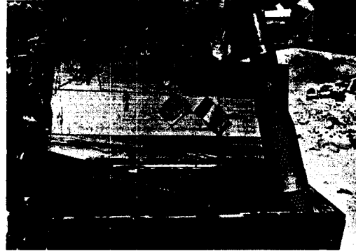
SOUTH VIET-NAM. Chinese language markings plainly visible on these 77mm. recoilless rifle shells found in offshore caves in South Viet-Nam show that they were manufactured in Communist China. At least 100 tons of North Vietnamese military supplies, mostly from Communist China and Czechoslovakia, were found in this spot alone.

"Today in South Viet-Nam we are witness to ... a war that is waged by men who believe that subversion and