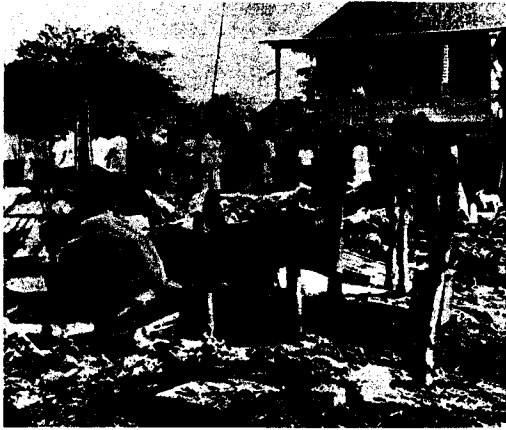
PHILIPPINES. Townspeople search the wreckage of their homes after a Communist-led Hukbalahap guerrilla raid on Luzon Island August 25, 1950. Guards ringed Manila after a weekend of terror by the Huks left a death toll of 85 persons in nearby communities.

excuse for a war of national liberation by giving the country its independence under a democratically elected government.