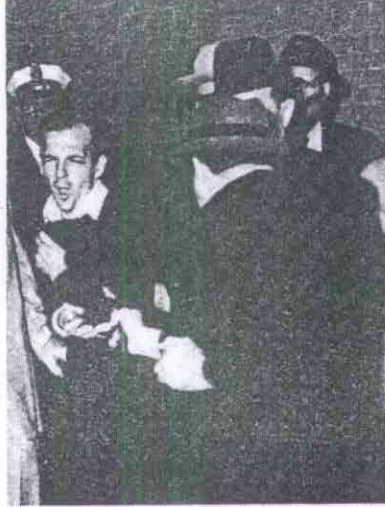
WHEN Oswald was fatally shot, clues to the mystery were lost.

FBI documents say they believe Oswald did sneak over the Texas border.