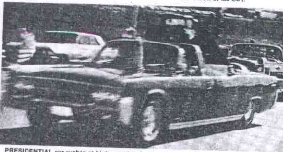
PRESIDENTIAL car rushes at high speed to Parkland Memorial Hospital after the shooting.

The Mannlicher-Carcano rifle is often used by the agency in the Caribbean, particularly by Cuban exiles working for