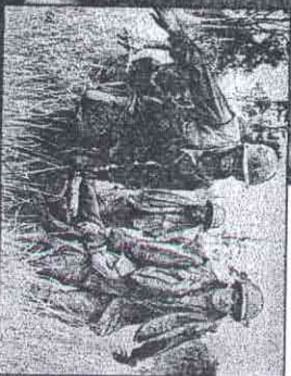
U.S. soldiers carry one of their dead to a helicopter, a sight that became increasingly familiar as the war dragged on.