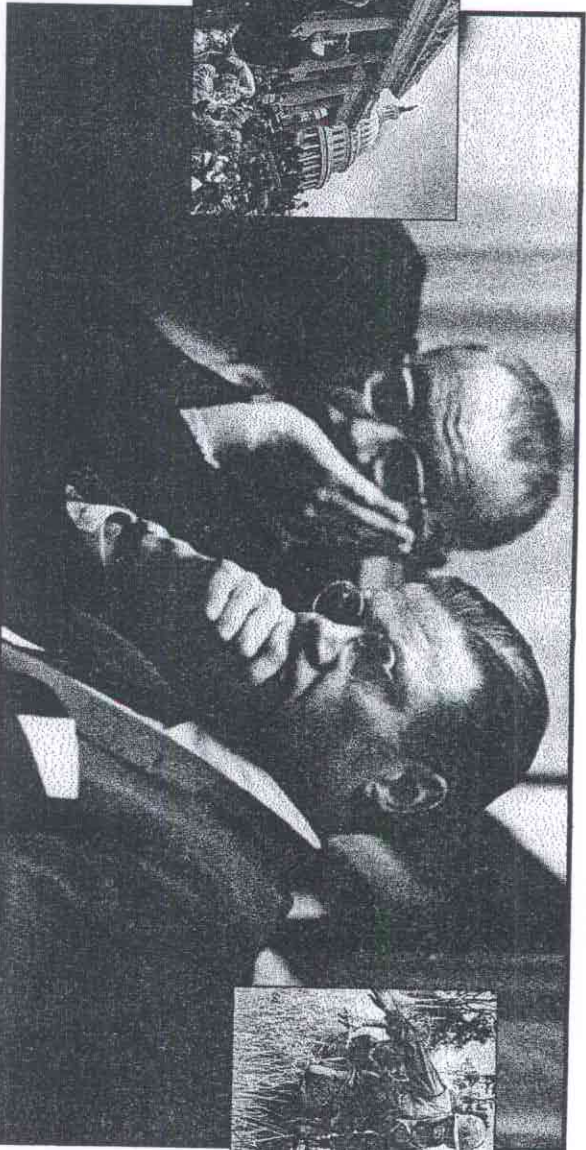
FROM THE MEMOIRS: THE TRAGEDY AND LESSONS OF VIETNAM

Antiwar protesters demonstrate in Washington in 1971. Above: and President Johnson with Robert McNamara on July 27, 1965, the day he decided to engage in a major ground war in Southeast Asia.