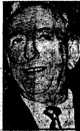
RICHARD RUSSELL Knew of Death Plots

The committee did deal definitively with another disputed piece of evidence — photographs that show Lee Oswald, a pistol at his belt, standing with a rifle in one hand and copies of two left-wing newspapers, The Militant and The Worker , in the other. Confronted with the photographs in jail after the assassination, Oswald disowned them: "They're my head superimposed on somebody else's body." Conspiracy theorists have