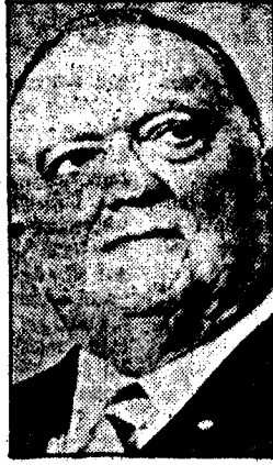
J. EDGAR HOOVER He Hated King

stabilize Castro's government and even mounted two attempts to kill Fidel Castro. High officials knew of these attempts, yet did not tell the Warren Commission during the 10 months in 1963-1964 while it was preparing its report. Among those who knew but did not tell were Robert Kennedy, the attorney general; Dean Rusk and Robert McNamara, the secretaries of State and Defense; J. Edgar Hoover, head of the FBI, which was the principal agency responsible for helping the Warren Commission; and high-ranking CIA officials, including Helms, who was in charge of CIA liaison with the Warren Commission. Not only that — two members of the Warren Commission, Allen Dulles, former head of the CIA, and Sen. Richard Russell of Georgia, actually knew about the Cuban matters and failed to tell the seven-man panel of which they were part. And, in a remark to the present committee that was almost unnoticed by the press, Helms made a sensational revelation that has never before been made public: President Kennedy himself knew of the attempts to kill Castro.