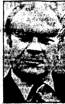
GERALD FORD Believes Original Report