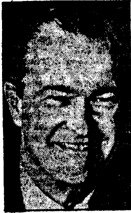
RICHARD HELMS Liaison With Committee