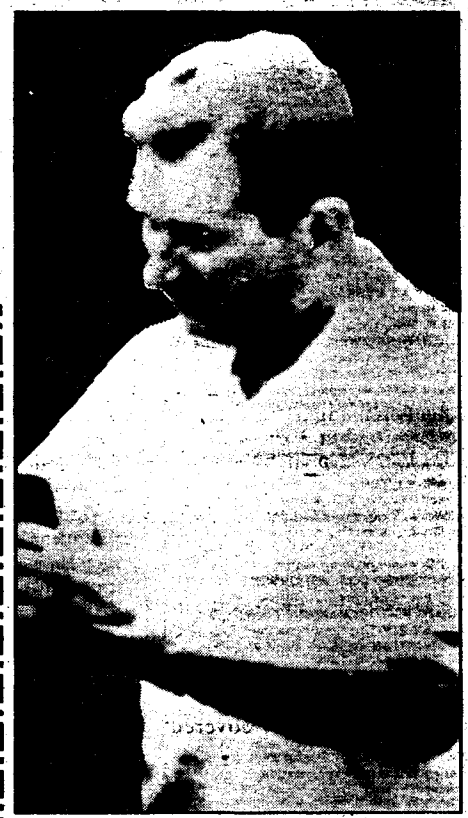
'SAUL': Kennedy's killer. Picture taken by CIA agents.