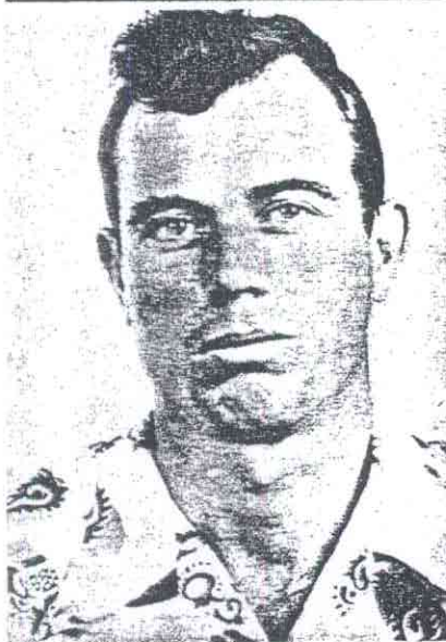
Dallas patrolman, J.D. Tippett.