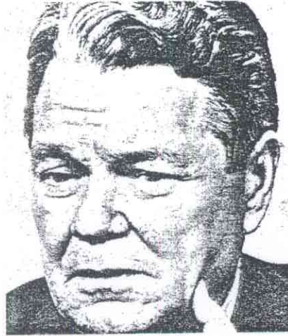
Rep. Harry Boggs of Louisiana disappeared October 1972.