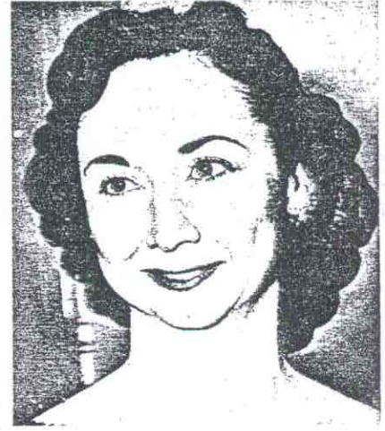
Veteran journalist, Dorothy Kilgallen.