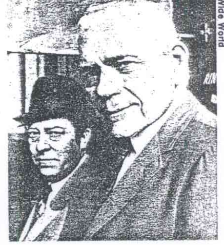
Clay Shaw (right) was accused and later acquitted of murdering JFK.