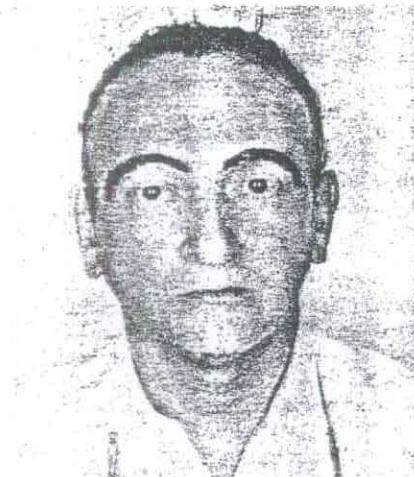
David Ferrie was a CIA pilot. One of his students was Lee Harvey Oswald.

Untimely deaths occur every day, and they were bound to befall at least some of the people who had a connection with Kennedy's assassination. Yet could the