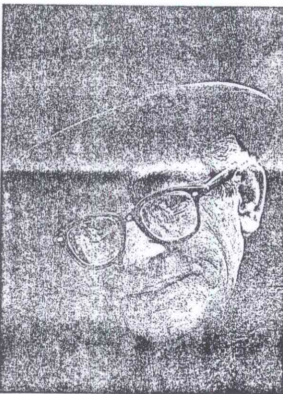
After the fall: spy catcher James Angleton in 1975

Unable to find a mole among Soviet defectors and counteragents, Angleton turned